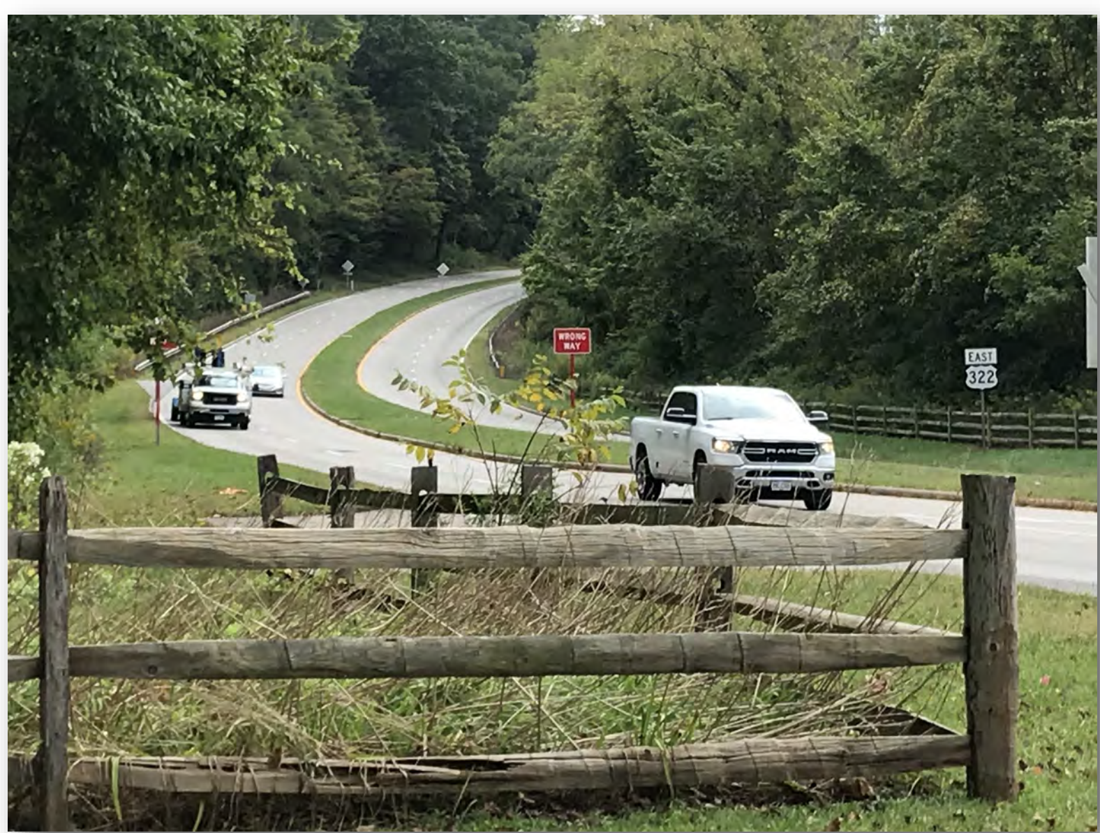
Traffic and speeding concerns on Mayfield Road