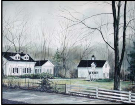
Artist's Rendering of Esquire's Cottage

Since its founding in 1931, The Gates Mills Garden Club has had a significant impact on the traditions and beautification of the Village. In May the club decorates street corners and community buildings with May Day flower baskets. In summer members plant and maintain the flower boxes on the North and South bridges over the Chagrin River. Throughout the year, members volunteer to provide the weekly fresh flower arrangements seen as one enters the library. The Club organizes special events including biennial Flower Shows that consistently earn top awards from The Garden Club of Ohio and the National Garden Club, and fundraisers such as the Garden Walk tours that raise scholarship money for students attending the Gates Mills Environmental Center. The Club engages in educational outreach to local schools, sponsors monthly luncheon programs, and arranges outings for members and their guests.