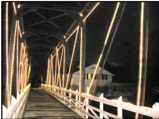
The Community Club sponsored the restoration and lighting of the walking bridge over the Chagrin River in 2004.

The Club is open to all residents of the Village (women and men) and provides a wonderful opportunity to get to know area residents while supporting the local community. The Club has an average membership of one hundred with a Board of twenty-five. The Board meets on the third Thursday of every month, September to May.