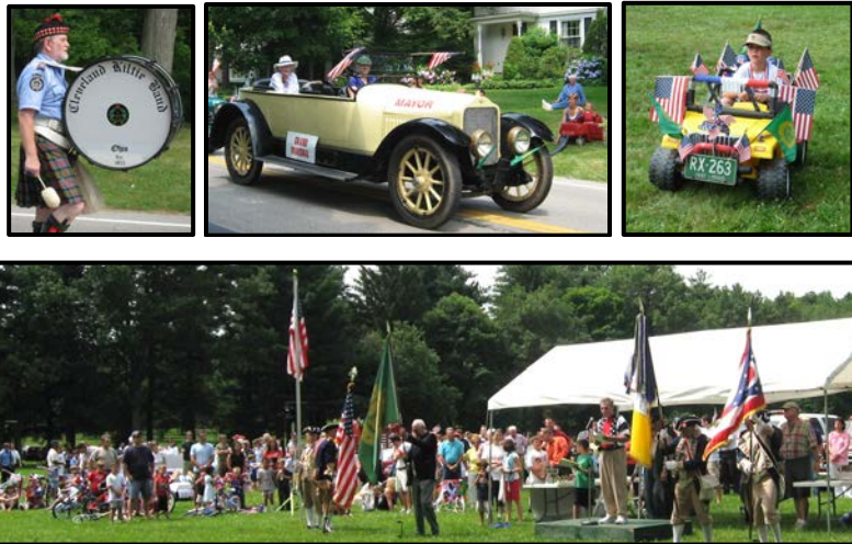
4 th of July Parade Activities

Today, The Gates Mills Improvement Society organizes the Fourth of July Parade, facilitates the annual village employee year-end bonus program, and supports various village activities including the Gates Mills tennis program, the Village Stray Animal program, and the annual Christmas Tree Gathering at the Polo Field on Epping Road.