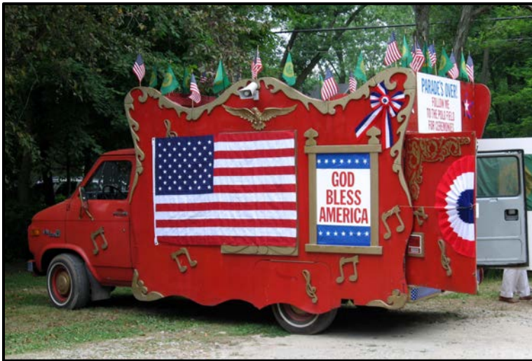
The Gates Mills Calliope is the Fourth of July Parade's Caboose.

Gates Mills is still a little village with a big tradition, but it is the tradition of neighborliness and community spirit that makes it unique.