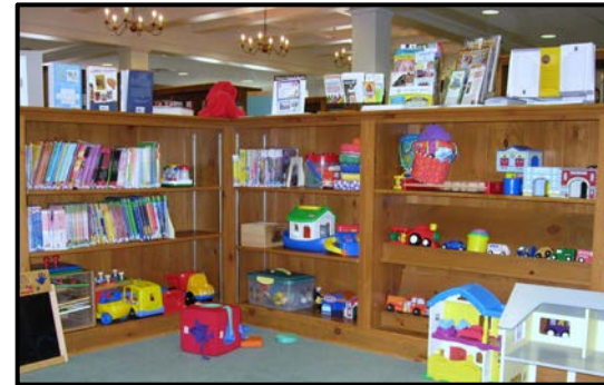
The Toy Library is a special part of The Children’s section of the Library.

Founded in 1974, The Friends of the Gates Mills Public Library is a non-profit group that provides vital support to the library. The organization contributes volunteers for library functions, provides funds for special programs, raises money through book sales at the library and oversees the traditional holiday cookie buffet all month long in December. The Annual Library Dinner in February at the Chagrin Valley Hunt Club is quite popular and features noted local authors as guest speakers.