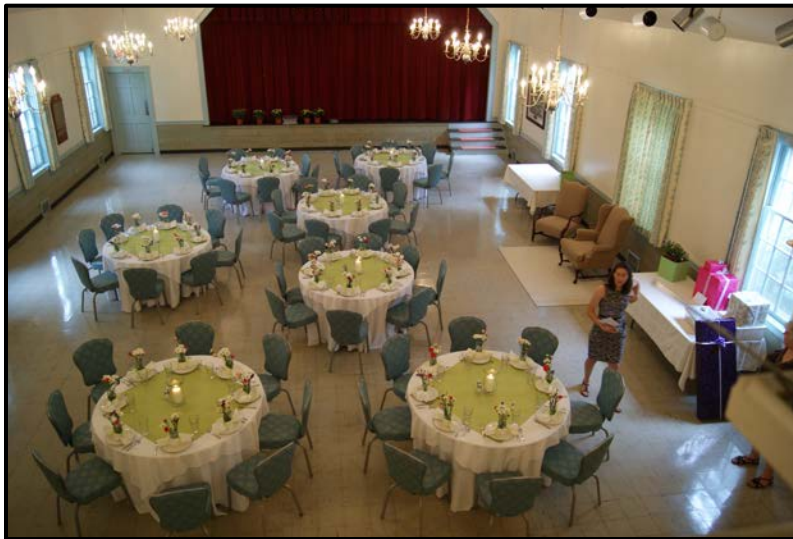
A Shower at The Community House

Security services are required for private parties. Applicants are responsible for arranging and paying for security personnel who must be approved by the Village of Gates Mills. For further information contact the Village of Gates Mills Police Department: 440.423.4456.