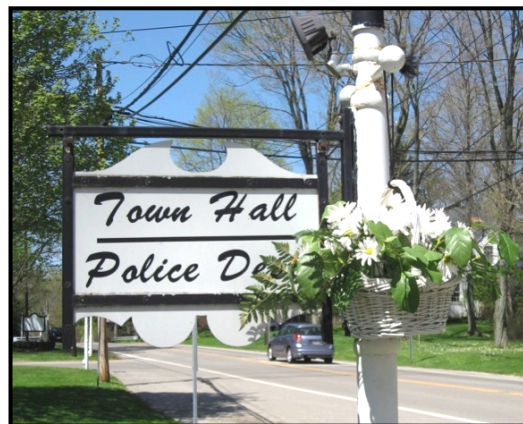
For May Day The Garden Club hangs baskets of daisies on street signposts to welcome Spring.