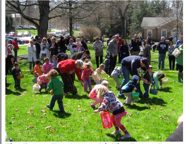
The Easter Egg Hunt with The Easter Bunny is followed by pizza and lemonade in The Community House.