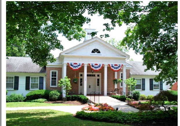
The Community House hosts dozens of activities including the summer Nature Camp for children.