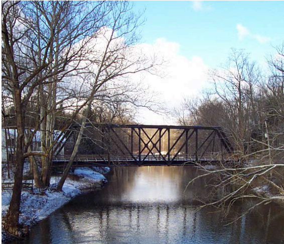
The Walking Bridge joins the village's business district with St. Christopher's Church, The Museum and The Hunt Club.