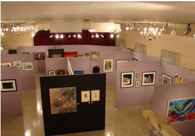
The April Art Show runs for two weeks and is a juried exhibition of paintings, drawings, prints, photographic art and sculpture.