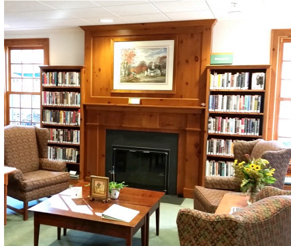
Villagers come to the Gates Mills Branch Library to visit with friends, read and enjoy the fireplace.